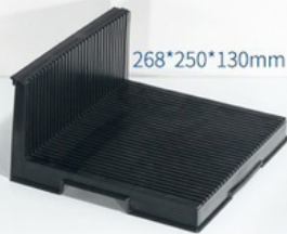
L type (medium)