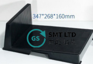
L type (large)