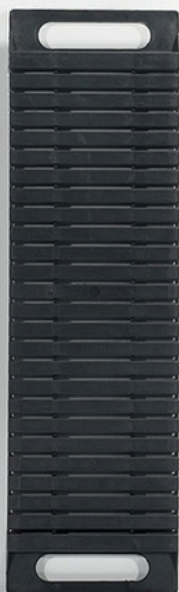
Long and double-ear shape (470*139*33mm)