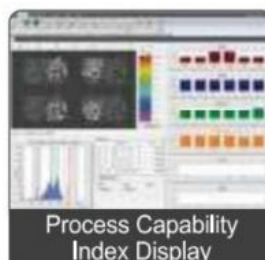
Process Capability Index Display