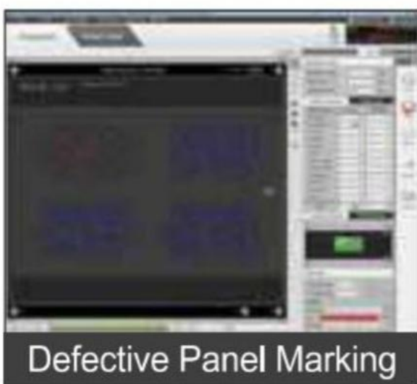
Defective Panel Marking