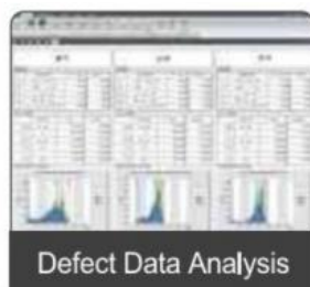
Defect Data Analysis